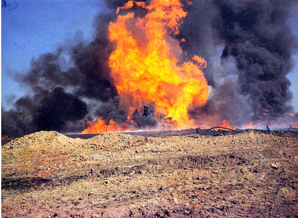
Kadi Oil Well (K-53) on Fire

In December 1985, I was commanding my Battalion 2 KUMAON (Berar) in Gandhinagar (Gujarat). On 15 December 1985, while I was returning from the evening games, I got telephonic message from the Brigade Headquarters that ONGC's Oil well Kadi (K-53) being sunk, was on fire and that the KUMAONIS were put on high alert to move on short notice to help combating the fire. For the next two days while we were on short notice, I drove down to Kadi about 40 kms away for reconnaissance to gain first-hand information.