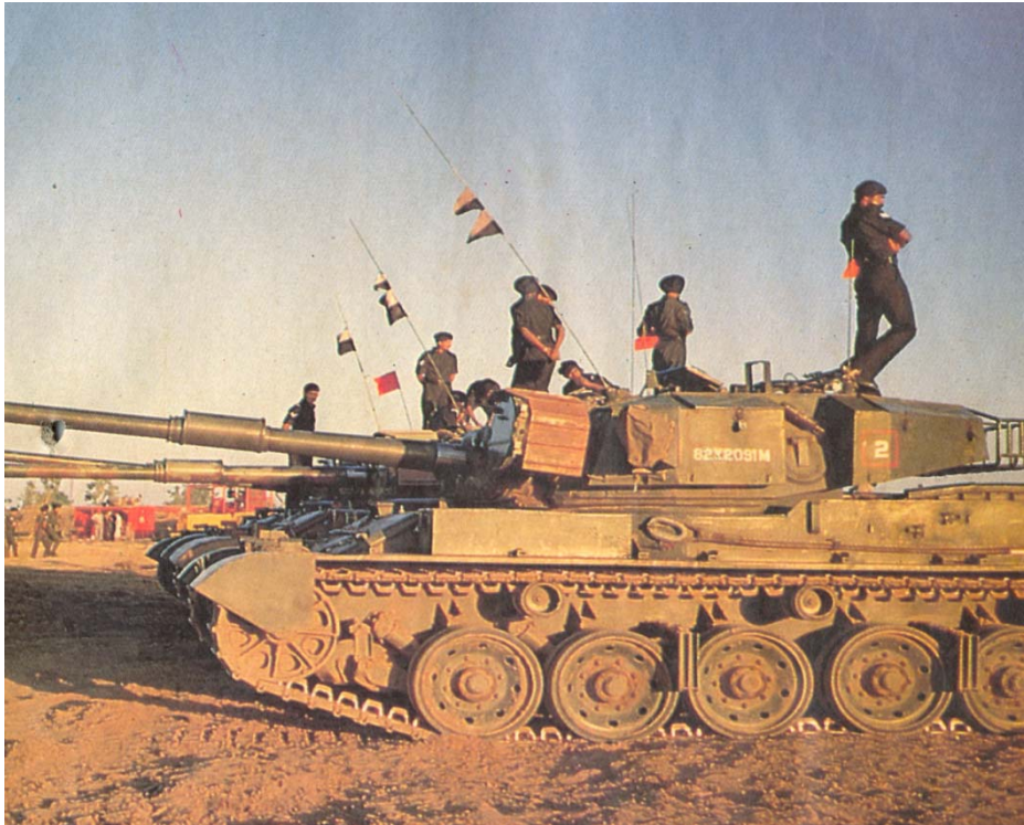
T-59 Tanks from the Army ready to blast the burning oil well

but to no avail. Meanwhile, the top brass of the Army and the ONGC, along with Baku fire-fighting experts decided to tame the blaze with tank fire and three Vijayanta tanks, from Ahmedabad Division, to shell the well with their 105 mm high velocity, high explosive squash head projectiles were positioned. I had my doubts on this mission's success too as what could not be achieved by firing 106 mm RCL high explosive projectiles was difficult to achieve with similar weapon system of the tanks as 106 mm RCL and tanks fire to destroy enemy armour and not to tame such devastating fires. The successful caving in of the blazing mouth of the well was only possible if the explosive was dropped and detonated vertically. The possibility of lowering explosive through a helicopter was a viable option but high rising flames, wind velocity and fear of collateral damage to Kadi village and railway track negated this option.